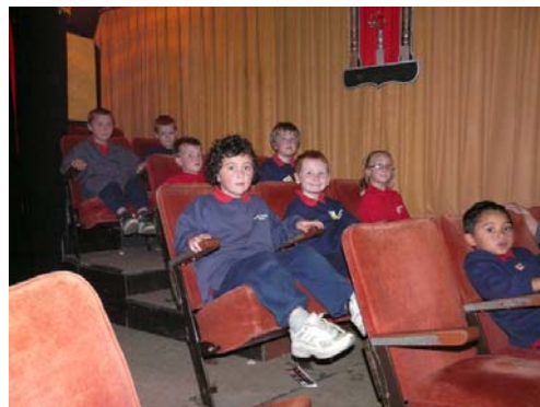
The Movie Theatre