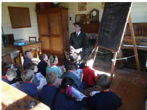
The School House

On Thursday the Junior Syndicate went to Ferrymead. First some children put on some dresses. Next we went to school. It was awesome.